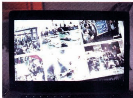
10 Images from a Lebanese newspaper via Facebook, 2012